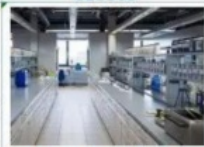
Application Lab Room