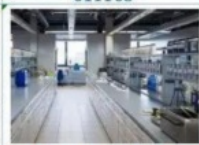
Application Lab Room